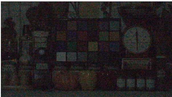
Existing product IMX222LQJ Gain 42 dB

Conditions: 0.1 lx, F1.4 (ADC 12 bit mode, 30 frame/s)