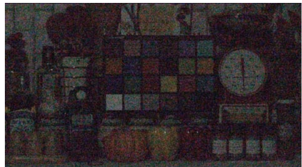
New product IMX323LQN Gain 45 dB